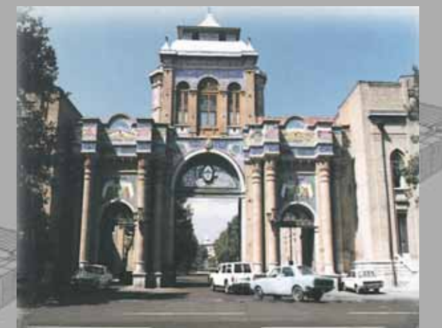
National Garden (Bagh-e Mellī)

Image: DK2 acquired by Russian North Geographical Co. Geometric correction, Image Processing, Cartography and Printing by National Cartographic Center of Iran