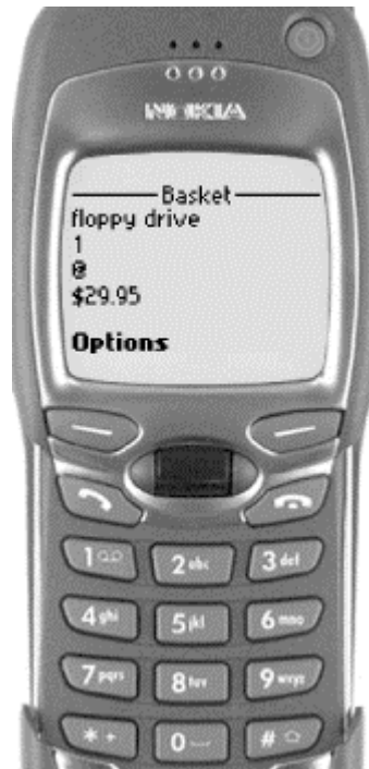
Figure 7.2. Shopping basket with poor table support

A browser with poor table support may render the same information in a format like Figure 7.2 .